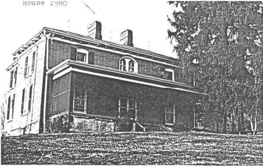
THE CARMACK HOUSE 1885 - 1985 2061 King College Rd. Bristol, Tennessee