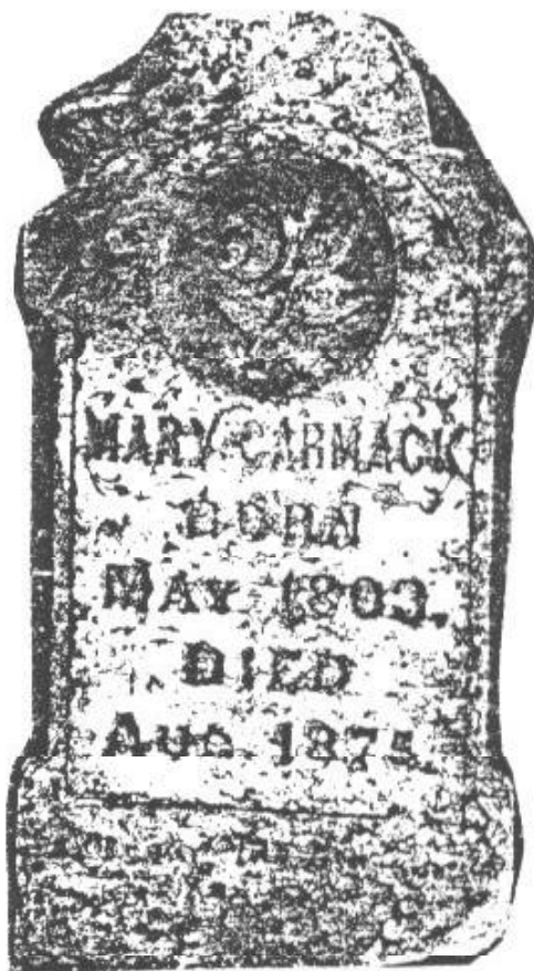
Teague Cemetery, Marion Co., Tn.