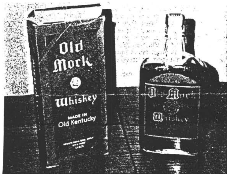
An unopened bottle of "Old Mock Whiskey" with its original box is a Prohibition-era collectible worth about $40.