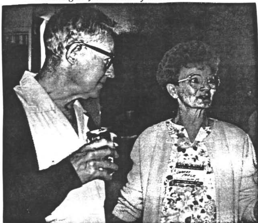
A Fun time was had by all!