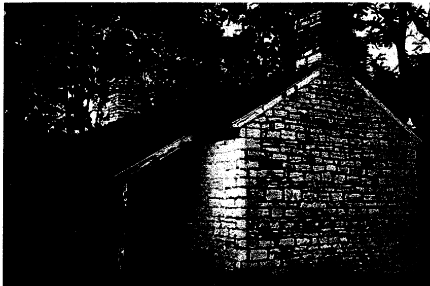
Cedar Grove Stock Farm taken summer 1998.