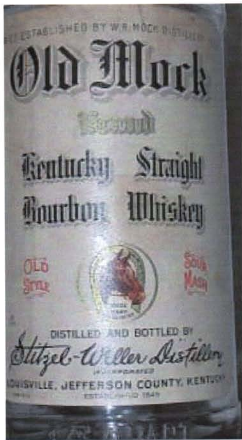
Old Mock Whiskey, bottled by Stitzel-Weller.